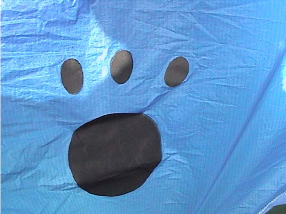
Bad Kitty leaves her mark!

I hope not to be repeated, see you all next year, same time same place!